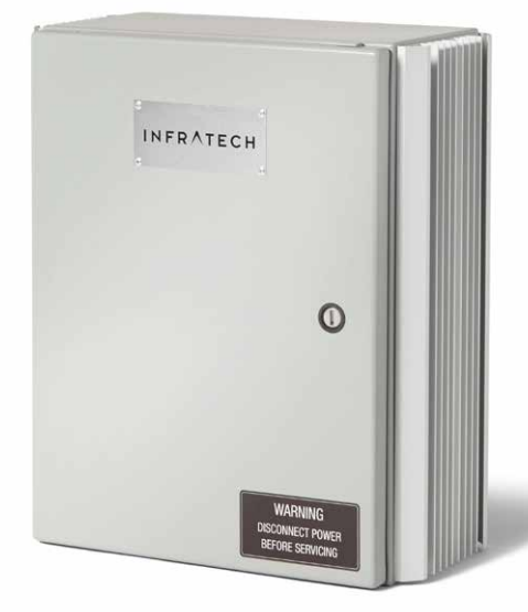
Faceplate cover not included