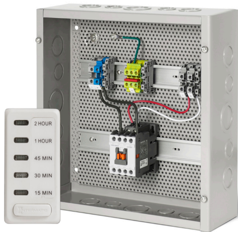
14-4700 CP-6000-1X Single Contactor Panel w/Cover — Digital Timer included