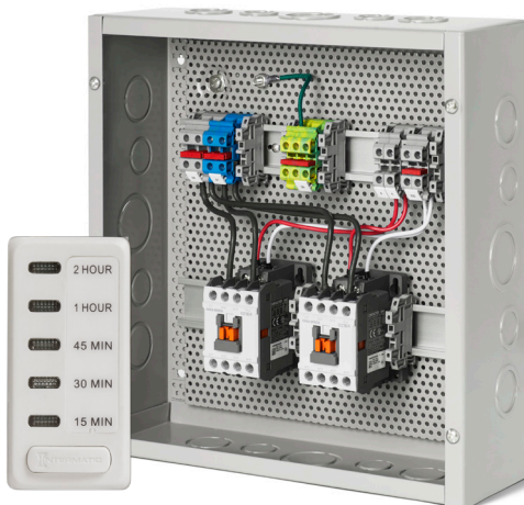
14-4710 CP-12000-2X Dual Contactor Panel w/Cover — Digital Timer included